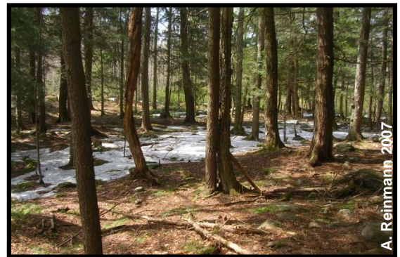
Upland conifer forest