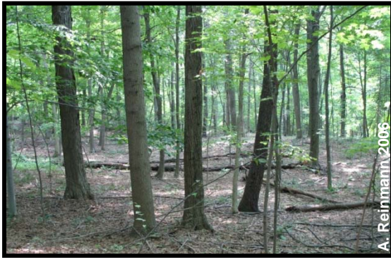
Upland hardwood forest

Upland (non-wetland) forests are the most prevalent and extensive habitats in the region. They are extremely variable in vegetation, ages and sizes of trees, size of forest patches, and character of the forest habitats, but forests of all kinds can provide valuable habitats for common and rare plants and animals. Large forests are critical habitats for many area-sensitive species—including raptors, songbirds, reptiles, amphibians, large mammals—that are disappearing from our increasingly fragmented rural landscapes. Because forests facilitate efficient water infiltration through the soils, forest preservation is perhaps the most effective means of maintaining the quality and quantity of groundwater and surface water resources . Forests provide many other essential services such as climate moderation and carbon sequestration .