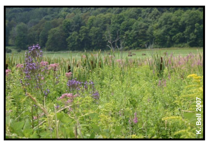
Calcareous wet meadow with blue vervain