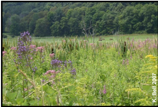
Calcareous wet meadow with blue vervain